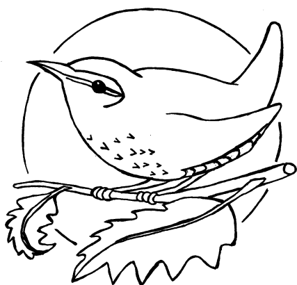
STAWLEY PRIMARY SCHOOL